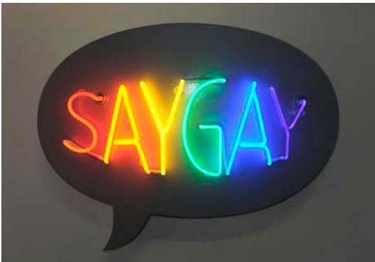
SAYGAY (Limited edition on silver background)

“SAYGAY,” a rainbow-colored neon tube on a silver cabinet is my response to the onerous “Don’t Say Gay” campaign. The cost is $1,750.