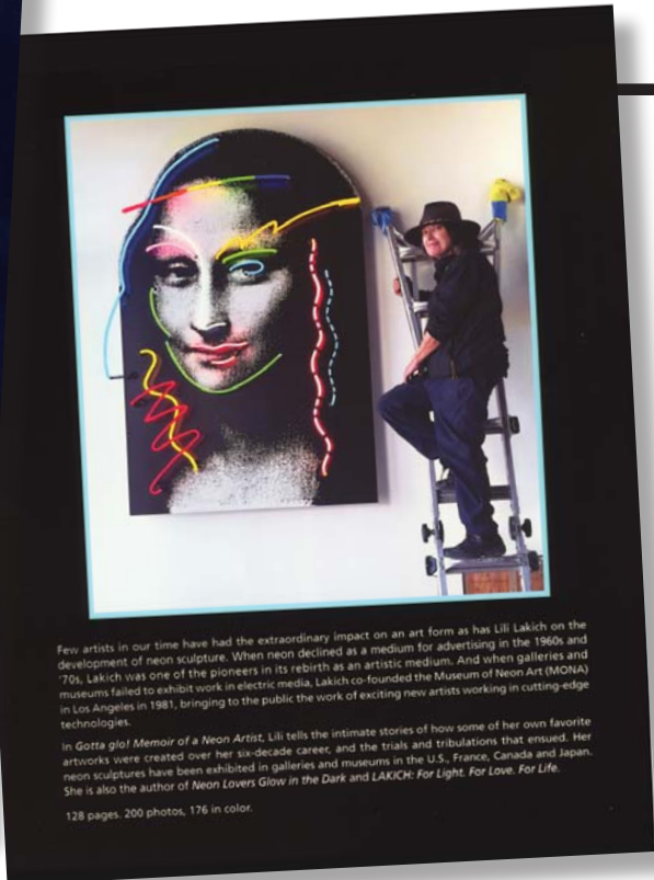
Back cover of Gotta glo! Memoir of a Neon Artist .